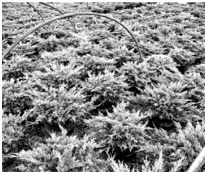
5 Gal Spreading junipers